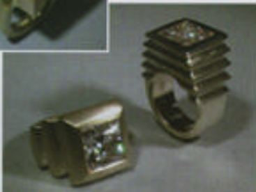
Pagoda rings are reminiscent of Asian architecture.