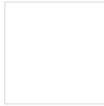
Accessory Find of the Week: Rachel Eva Designs